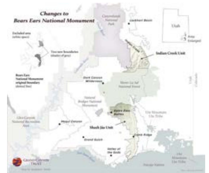
Less than a year after the Obama Administration’s designation, Bears Ears National Monument was reduced by more than 80% by President Donald Trump. Map courtesy of Grand Canyon Trust.