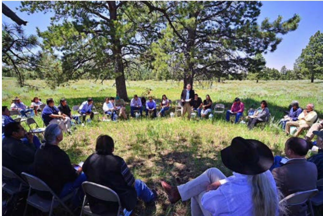
A gathering of the BEITC and other Monument advocates.

a cultural connection to the landscape and have pledged their support to the BEITC-led national monument proposal, see this land as sacred. To date, 30 Tribes have pledged support to protecting the Bears Ears landscape for all future generations. In addition to many historically and culturally significant sites, the landscape provides plants that are used as traditional medicines, and the plants and animals in the area support Tribes' ongoing subsistence practices. 18