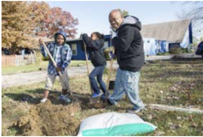
Deep Blue, a program of Blue Water Baltimore (a GBWC steering committee member), works together with community members to support clean water and strong local initiatives.

Team plan was centered upon the Brooklyn neighborhood of South Baltimore, specifically the revitalization of a seven-acre existing city-owned park, Garrett Park. The goal was to envision Garrett Park as a centerpiece for community revitalization and to enhance the nearby Middle Branch of the Patapsco River. The Chesapeake Center for Youth Development, a local community organization, took the lead in ensuring community members' involvement in the planning process. The APA Community Planning Assistance Team worked with the Chesapeake Center for Youth Development to interview local stakeholders and community residents, including children, during the planning