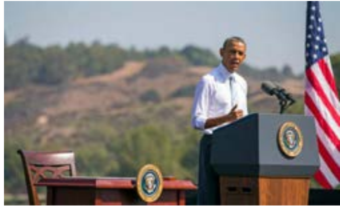
President Barack Obama establishes Bears Ears National Monument in 2016.

Toward this aim, the BEITC crafted a proposal for a national monument that would ensure Native values were clearly represented in any land management actions in the area. The Native-developed and -led proposal was historically unprecedented. As the Navajo non-profit group Utah Diné Bikéyah notes, although the Antiquities Act of 1906 was created to protect Indigenous artifacts, this was the first time Native Americans had initiated a proposal to invoke those protections. 12 The initial Tribal proposal to the Obama Administration encompassed 1.9 million acres surrounding the iconic Bears Ears buttes.