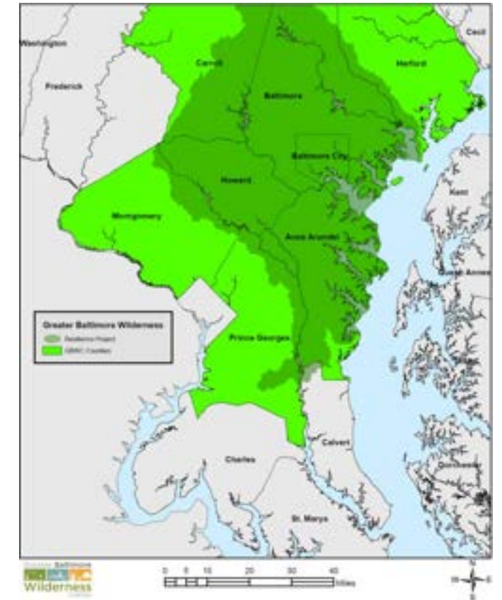
Map of the Greater Baltimore Wilderness Coalition's project area.

Masonville Cove is located on the Middle Branch of the Patapsco River, which became increasingly polluted from open sewers, fertilizers, and detergents leading to algal blooms that stifled life within the river and the bay. As industry in the Masonville area declined, abandoned lots became dumping grounds littered with debris. These derelict lots and the construction of Interstate 895 left nearby neighborhoods of Brooklyn and Curtis Bay cut off from the Cove. Today, these communities are part of what is known as the Greater Baybrook Peninsula, a racially and ethnically diverse area whose Latinx and Black populations nearly doubled in the period between 2000 and 2016—a trend that is expected to continue. 4