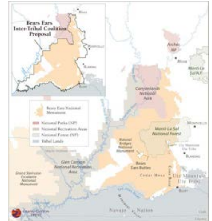
President Barack Obama designated 1.35 million acres as Bears Ears National Monument in 2016; inset: the larger 1.9-million-acre area proposed by the Bears Ears Inter-Tribal Coalition.

The Indigenous-led Bears Ears National Monument proposal represents a welcome evolution in conservation in that it is not centered upon the traditional dominant culture conservation/preservation viewpoint. Instead, the core issue is one of Tribal sovereignty and the Tribes’ right to manage the land. The five Tribal Nations that comprise the BEITC, as well as many others that have