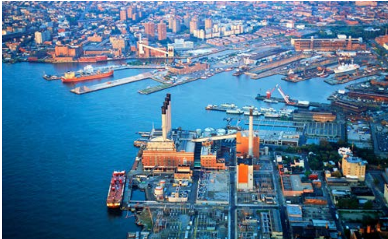
The Port of Baltimore, situated along the tidal basins of the three branches of the Patapsco River, is one of the largest port facilities in the U.S.

natural components interact to create unique effects not found in wild or rural areas. The study also laid the foundation for what is now a rich history of community-based environmental work in Baltimore, characterized by active engagement with and buy-in from the city's diverse communities. This work has faced many challenges, but currently looks bright as the Greater Baltimore Wilderness Coalition builds momentum for equity-focused conservation goals and the USFS Northern Research Station continues its important work.