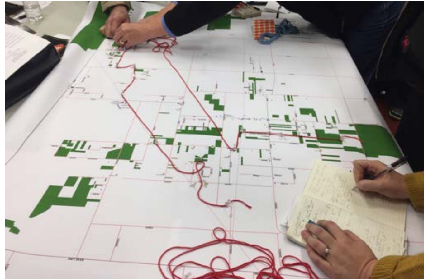
Sustainability planning sessions with PHP community members and conservation stakeholders.

The Nature Conservancy's top-down land acquisition strategy has evolved in recent years as a result of these advances. A dialogue with community members facilitated by the Museum began in 2016, resulting in TNC placing a moratorium on land acquisition in order to give time and space to work