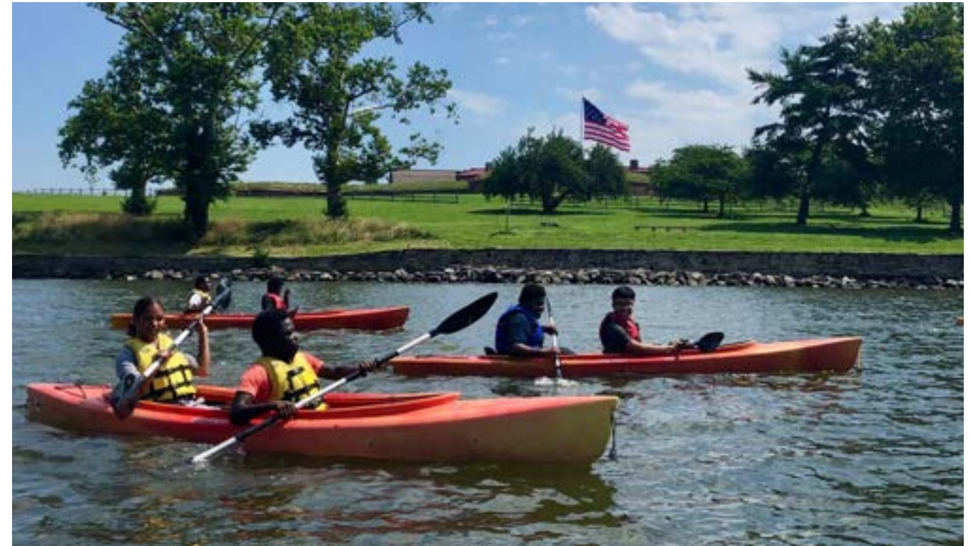
Baltimore teens kayak at Masonville Cove.