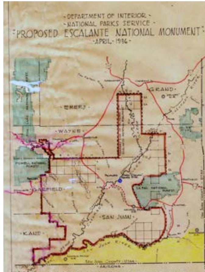
Proposed map of the four-million-acre Escalante National Monument, 1936.

Today, the tribes continue to work to protect this sacred landscape from harm, buttressed by increasing political and mainstream conservation support, but with mixed results due to changing U.S. federal administrations and priorities.