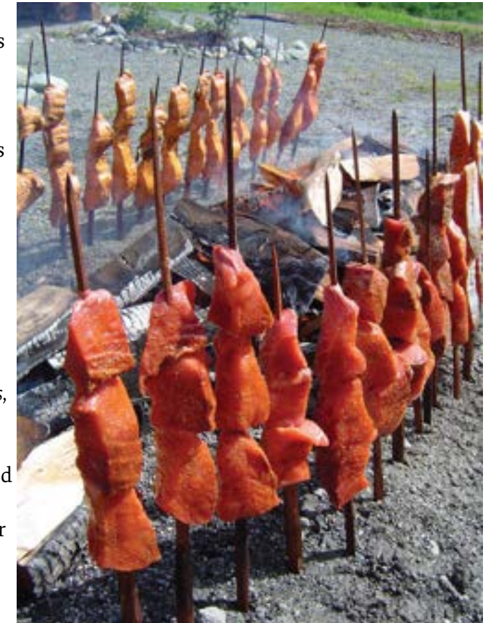
Salmon baking the traditional way.