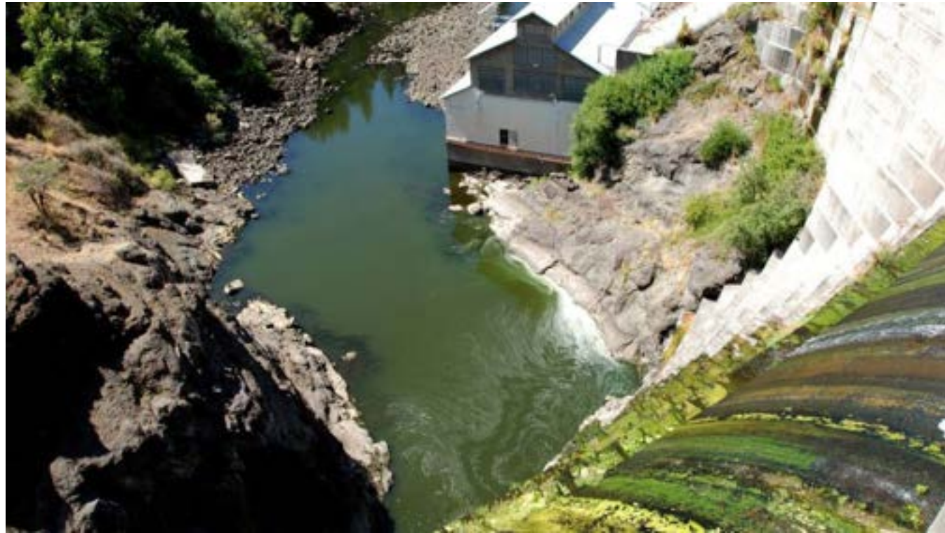
Water trickles over a dam on the Klamath River outside Hornbrook, CA.