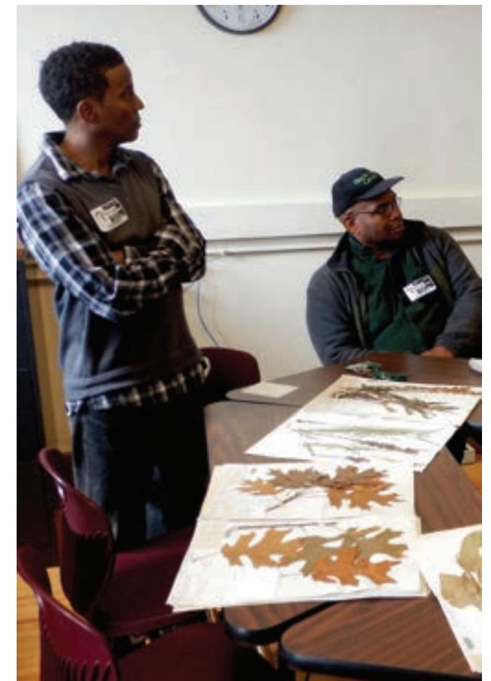
The Field Museum's Quality of Life planning sessions were held from March to June 2016 and involved more than 100 PHP residents and stakeholders.

One major positive development was involvement by the Field Museum of Natural History in Chicago. In 2016, using methods developed by Field Museum anthropologists to advance community buy-in for natural resources conservation abroad, the Field Museum (TFM) conducted a series of stakeholder interviews. The interviews indicated the need for a more in-depth and nuanced understanding of the relationship between the community and its natural resources. This development led to their conducting of a Quality of Life Process Report in PHP to establish land-use planning recommendations. This process mirrored TFM's methodology for similar community reports in Amazonian communities in South America. The purpose of the process was to identify and prioritize community sentiments and attitudes towards land-use alternatives and practices for the future. Because "the natural environment depends on people for its continued health, just as people depend on healthy nature for their quality of life," engagement and collaboration with the PHP community was essential to the process of identifying priorities and developing plans