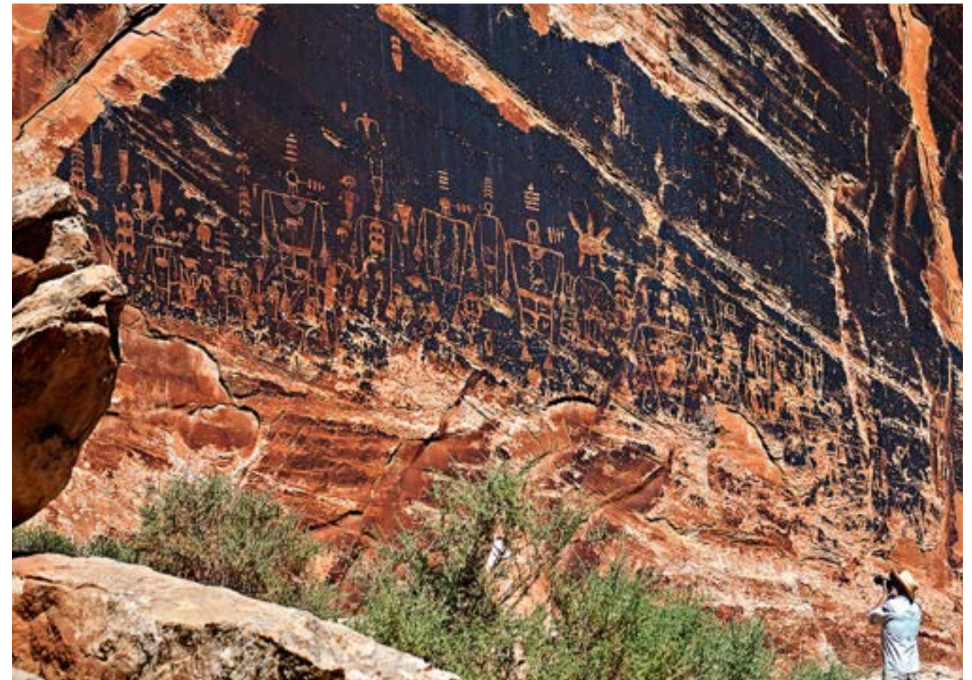
Petroglyphs near the San Juan River.