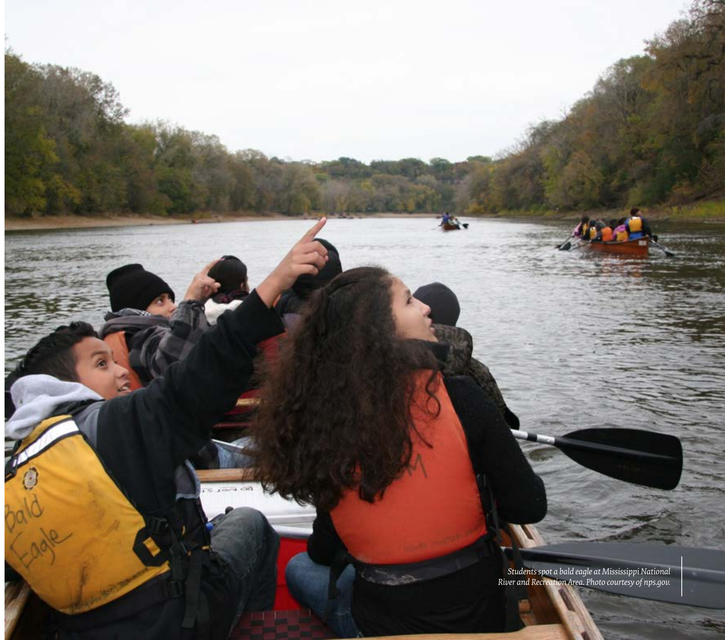
Students spot a bald eagle at Mississippi National River and Recreation Area.

Yellowstone National Park recognizes that at least 26 different tribes used the area for trade, hunting, gathering, medicine, and ceremony before the U.S. Congress “gifted” 2.2 million acres to the American people to create the park. 2 Spurred by the compelling myth of the preservation of “pristine wilderness,” places supposedly unaltered