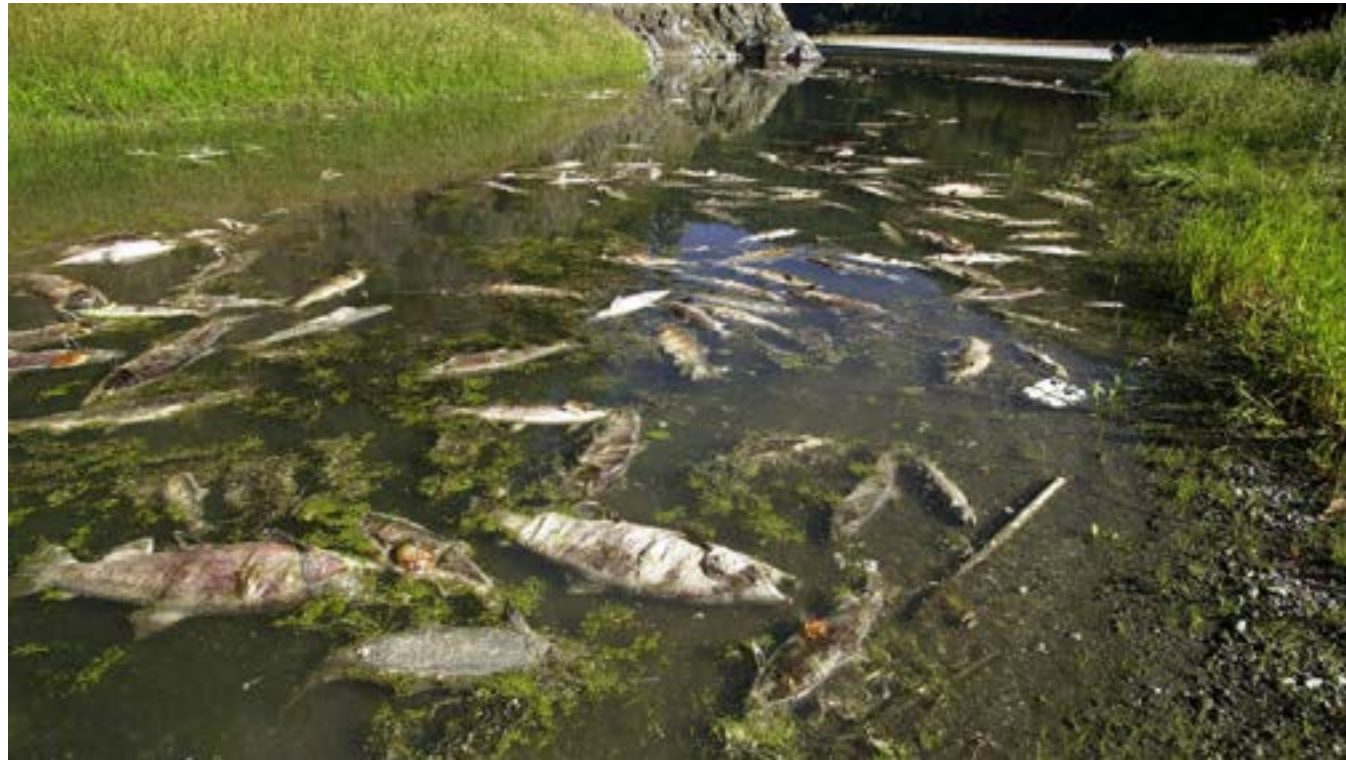
Dead salmon along the Klamath River on Oct. 1, 2002, near Klamath, CA.

Beginning in 1908, the river faced enormous challenges as a series of hydroelectric dams were built by the California and Oregon Power Company (Copco), now known as PacifiCorp. The construction and operation of these dams persisted despite the senior water rights held by Tribes. Coho and Chinook salmon, both of which are keystone species of the Klamath Basin, are now listed as threatened and are candidate species under the federal Endangered Species Act (ESA). This precipitous salmon decline is due to dam-related degraded habitat conditions, including insufficient water flows, algal blooms from warm, stagnant water, and lack of access to traditional spawning territory.