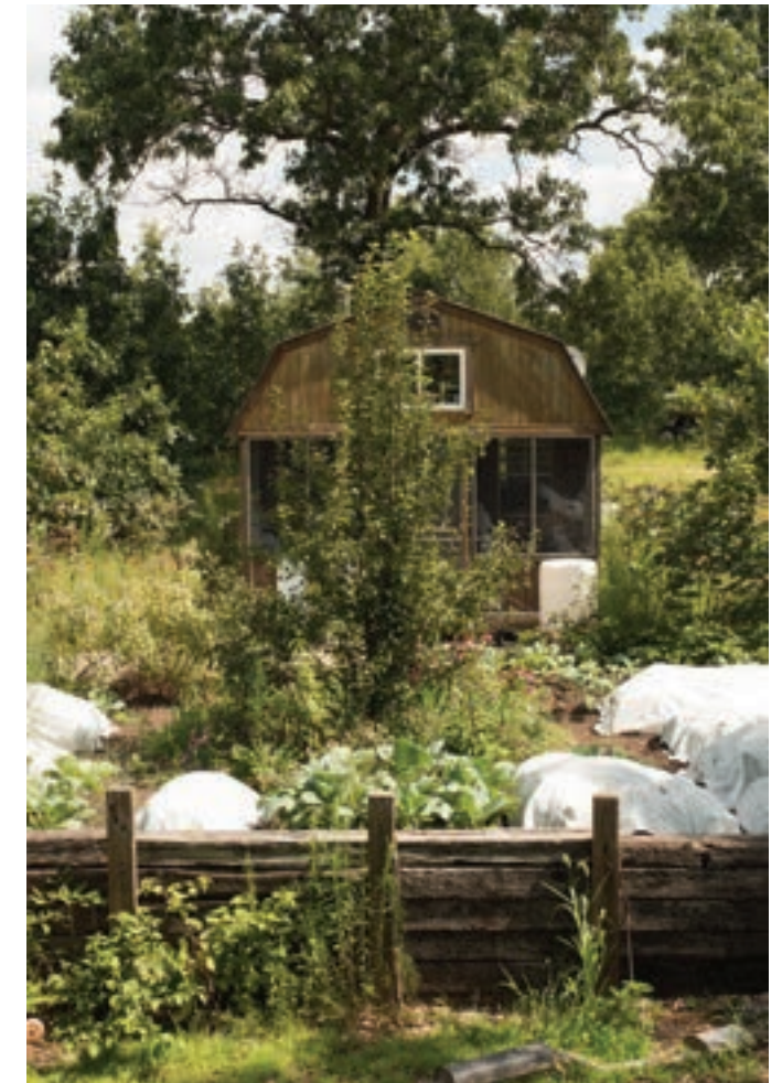
An African American family's homestead in Hopkins Park.

Landscape connectivity becomes more complicated as property boundaries increase in number through many small land holdings, and this is the case in most areas of the country east of the Mississippi River. In PHP, half-acre plots that share borders with larger protected units have the potential to enhance biodiversity and ecological resiliency, and landowners are often aware of the natural health of their small landscapes. To protect broader landscape values, conservation practitioners must become more flexible in their approach to connecting these landscapes. Todd Boonstra of USFWS and Kim Roman of INPC have both identified an individually tailored approach as key to their work with private landowners. For Roman, the goal is, “to meet that landowner